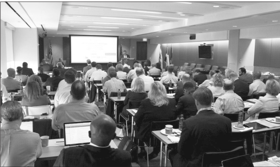
A scene from the ACC Value Challenge.