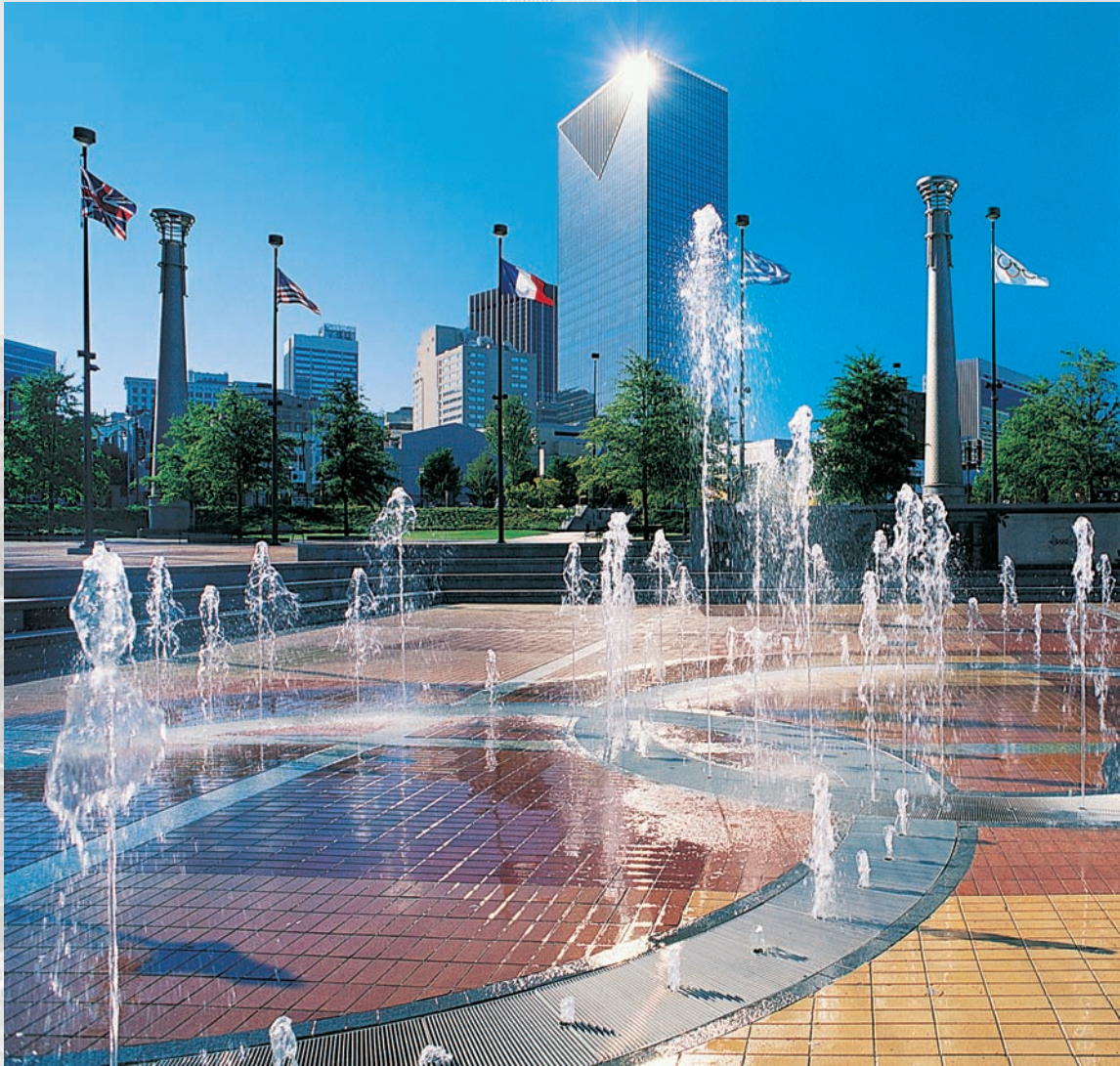
Centennial Park, Atlanta, Georgia