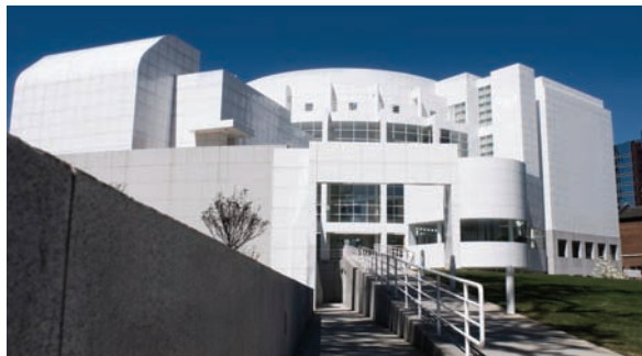
High Museum of Art, Atlanta