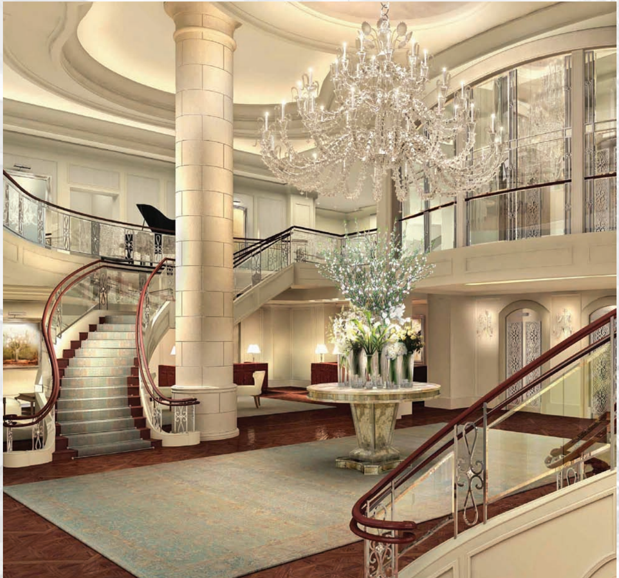
St. Regis Hotel – Atlanta , Georgia