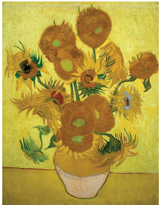
Sunflowers , 1889, Van Gogh Museum, Amsterdam